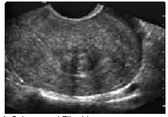
Fig 4: Submucosal Fibroid