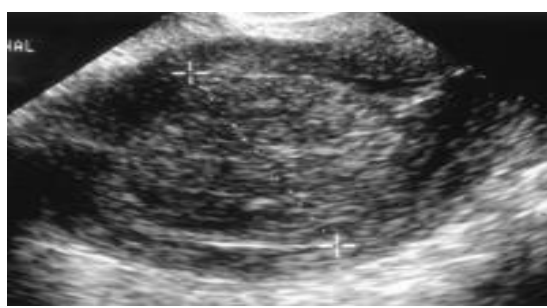
Fig 3: Endometrial Carcinoma

Endometrial carcinoma is most commonly prevalent in the postmenopausal age group over 50 years. Patient presents in OPD with postmenopausal bleeding alone or combined with serosanginous discharge.<sup>2</sup> At USG, mass like thickening of the endometrium is present, which may have a heterogeneous echo texture, which needs to be differentiated from necrotic fibroid. Postmenopausal endometrium thicker than 5-6 mm should always be evaluated with a suspicion of malignancy. <sup>5</sup>(Fig 3 and Fig 4)