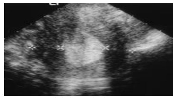
Fig 1: Endometrial Hyperplasia

Endometrial hyperplasia is the result of unopposed estrogens on the endometrium as there is hormone imbalance in this age. At USG, endometrial hyperplasia appears as echogenic thickening which represents endometrium on opposed surfaces of the uterine walls along with central endometrial canal (with or without cystic degeneration). This finding must be differentiated from RPOC's or blood clots on the basis of the history and Doppler evaluation (RPOC's will have blood flow). (Fig 1)